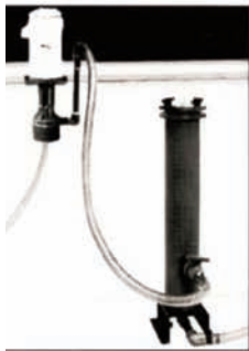
MODEL ZDD-900 WITH THREE TUBE CHAMBER

Pump mounted outside tank, chamber floor mounted outside tank